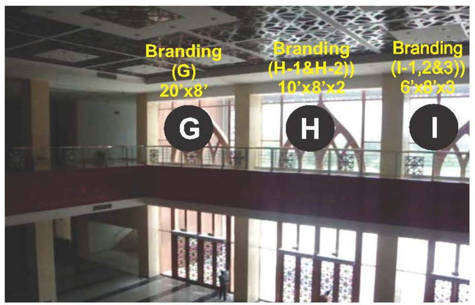
Reserved for Diamond (G), Gold-1&2 (H-1,2) & Silver-1,2&3 (I,1,2&3)